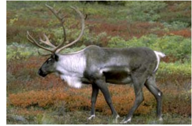
Vadzaih Cho Bull Caribou