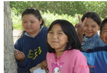
Nature Day In Aklavik June 2006