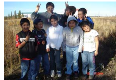
Nature Day in Tsiigehtchic September 2006