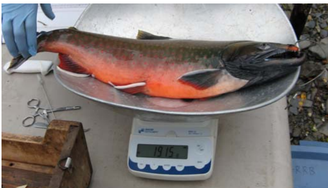
A mature male char in breeding colour

“The research has opened up many new and interesting possibilities for study”