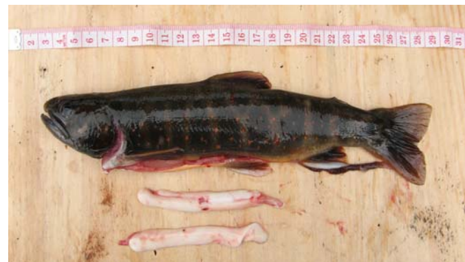
A resident male char: this fish is quite small (10”) but is mature (has large gonads). This fish remains in freshwater for its entire life.