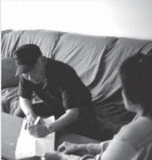
Gwich'in Harvest Study participants are in a win-win situation as they can both win prizes and help protect fish, wildlife and harvesting rights.

We will continue to give out prizes in 2004 to people that are participating in the Harvest Study. So good luck and keep up the good work!