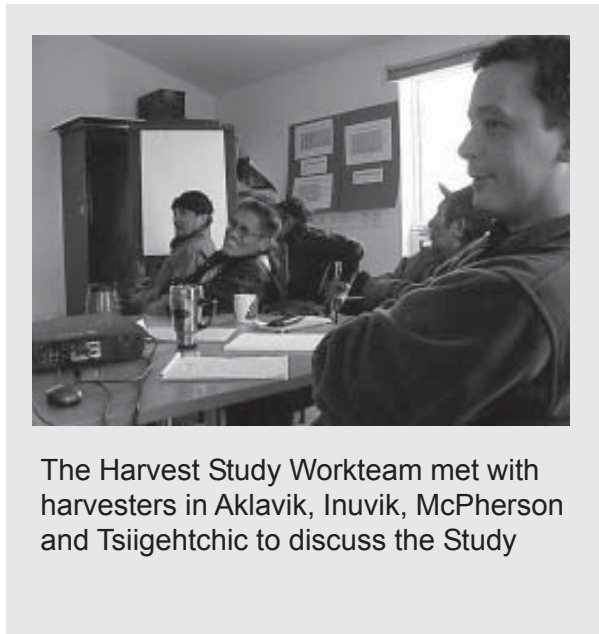
The Harvest Study Workteam met with harvesters in Aklavik, Inuvik, McPherson and Tsiigehtchic to discuss the Study

This fall, the Gwich'in Harvest Study office staff made presentations of the Study's findings in each of the communities. This was a chance for harvesters to see where their information has been going and how it's looking. It was also a chance for people to meet, get together over lunch and talk about the Study.