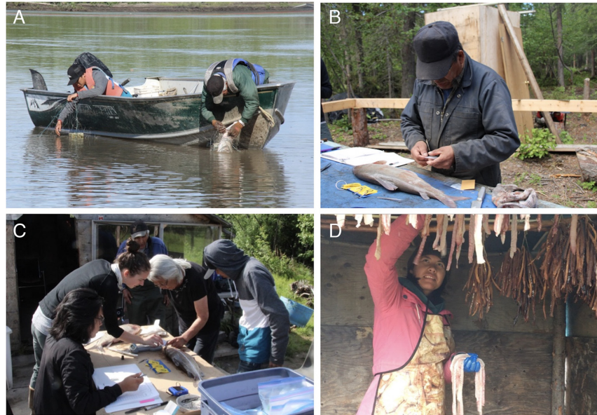
Fig. 5. Whitefish are harvested in gillnets (A) and sampled (B and C) before being frozen or smoked and dried for consumption (D).

whitefish prior to 2005 (VanGerwen-Toyne et al. 2008; Harris et al. 2012; Millar et al. 2013), but relatively few efforts have focused consistently on this species and the GRRB has therefore highlighted an outstanding need for baseline data.