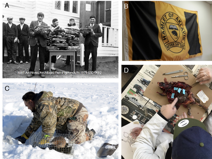
Fig. 4. (A) Rat Sunday collection in Aklavik 1933 (Northwest Territories Archives; used with permission), (B) the flag of the Hamlet of Aklavik featuring a muskrat (Farnel 2017; used with permission), (C) muskrat live trapping by community members (photo by J. Brammer, individual featured with permission), and (D) a community carcass collection project (photo by J. Brammer).

This harvest by trapping and shooting was such a cornerstone of the economic and cultural life of Gwich'in communities in the GSA that muskrats pelts were used for church collections on “Rat Sunday” (Fig. 4A), and the muskrat was included on the flag of the Hamlet of Aklavik (Fig. 4B). The underlying importance of muskrats and ratting season in Delta life was described by a young trapper living in Inuvik, “it doesn’t quite feel like springtime in the Delta if you don’t go out and get some rats, after a long cold winter you get out there in the spring ... it’s just good for you ... Therapeutic, for Delta people” (Turner et al. 2018, p. 607).