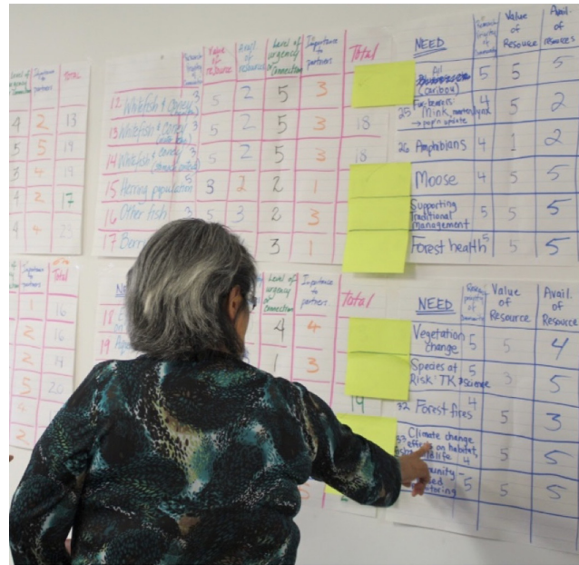
Fig. 2. Decision-making during the 2017 Gwich'in Renewable Resources Board (GRRB) Research and Management Priorities Workshop in Aklavik, Northwest Territories.

Information S1 2 ) based on feedback and concerns obtained from the RRCs. This list does not consider whether past or ongoing research has addressed these concerns and is not restricted by the GRRB's mandate to manage fish, wildlife, and forest resources. The shortlist of GRRB-approved "Research and Management Priorities" (Supplementary Information S2 2 ) is developed during a Research Priorities Workshop, first held by the GRRB in 2013 and now repeated every five years. This involves analyzing the Research and Management Interests list, omitting interests that have been addressed by past or present research projects, and then scoring the remaining interests according to a set of Board-approved criteria. Criteria for scoring Research and Management Interests have included, but are not limited to, identifying whether an interest fits the GRRB's mandate, is important to communities, and can be addressed using available resources. This is all carried out during a two-day workshop with co-management partners including the RRCs, the Government of the Northwest Territories (GNWT), and the Gwich'in Tribal Council (GTC; Fig. 2). Research and Management Interests are ranked according to their scores, and the GRRB subsequently selects and publishes their Research and Management Priorities on their website.