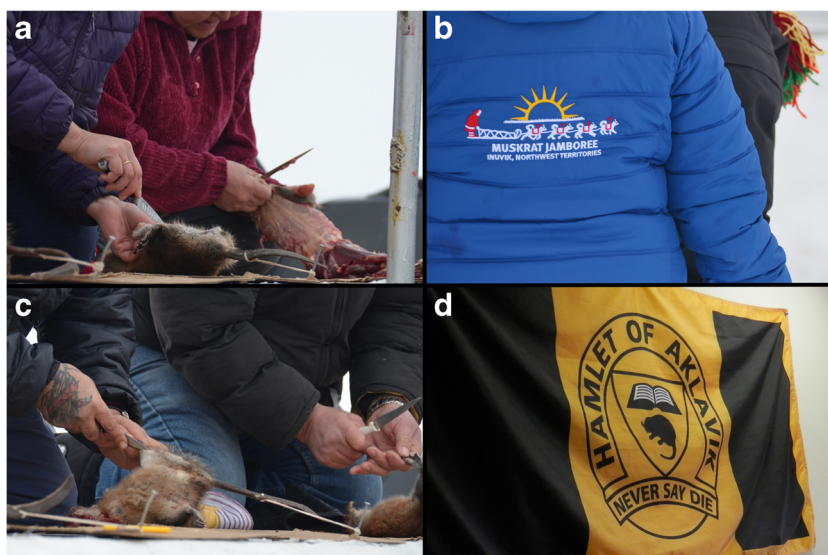
Fig. 3 Images showing the ongoing cultural importance of muskrats in the Mackenzie Delta. a–c) Muskrat jamboree and participants in the muskrat skinning contest 2016. d) Aklavik town flag.

those without jobs may have the time and energy, but not the financial opportunity, to go out harvesting.